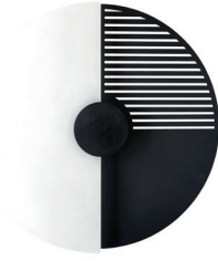
Finition Stripes Stripes finish