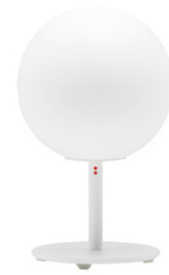
Table lamp with diffuser in satin-finish white blown glass. Supporting structure made of metal or polyester reinforced with glass fibre, painted white.