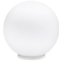
Table lamp with diffuser in satin-finish white blown glass. Supporting structure made of metal or polyester reinforced with glass fibre, painted white.